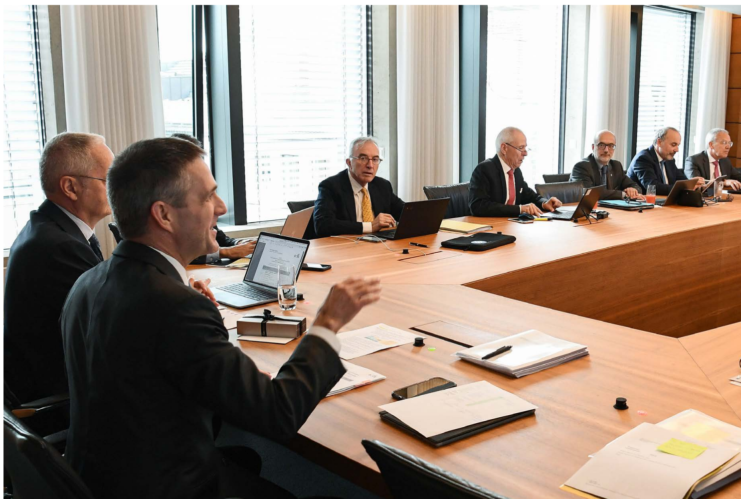
Members of the SFI Foundation Board during a meeting.