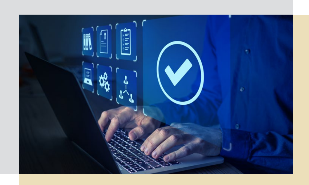
English Version | 2023 Edition